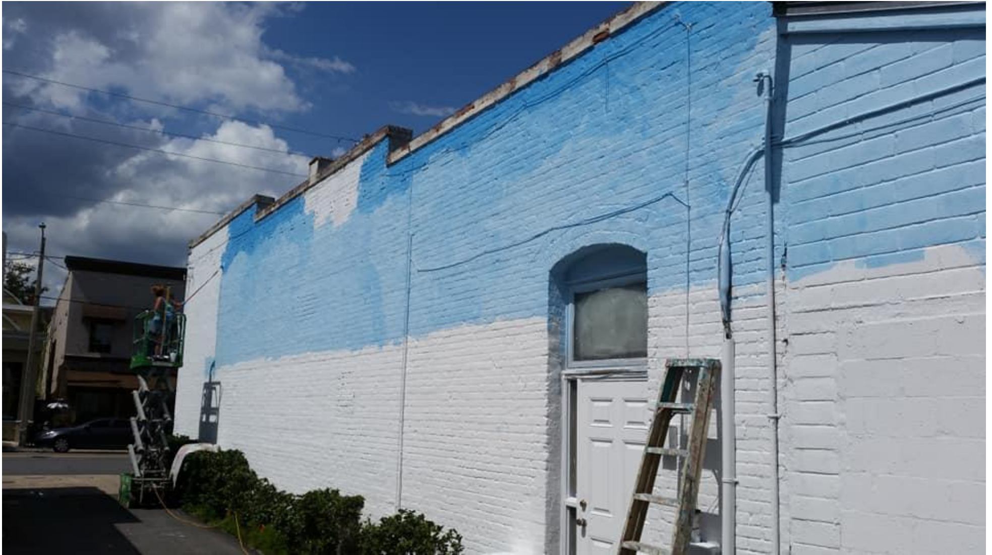
First Layer of sky being applied.