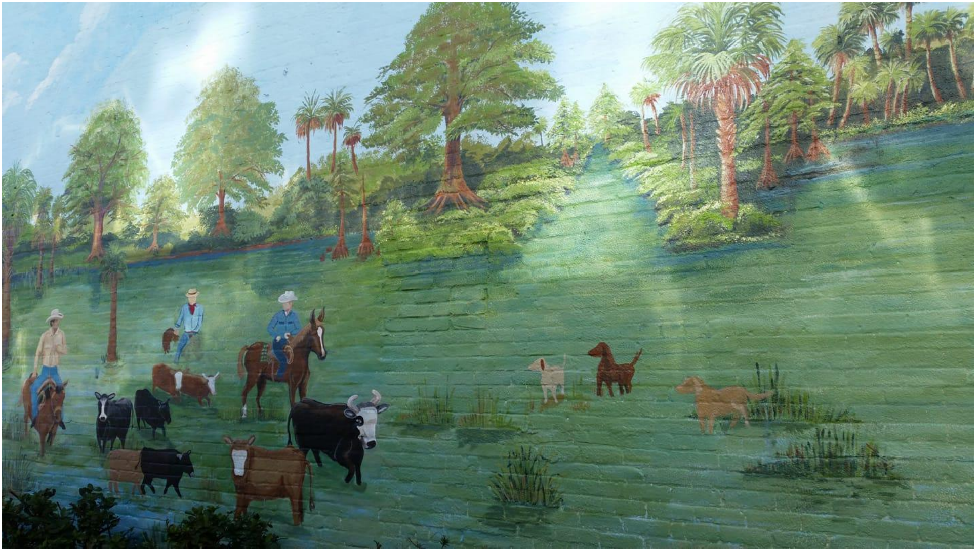
Starting the people, cow, dogs and horses!