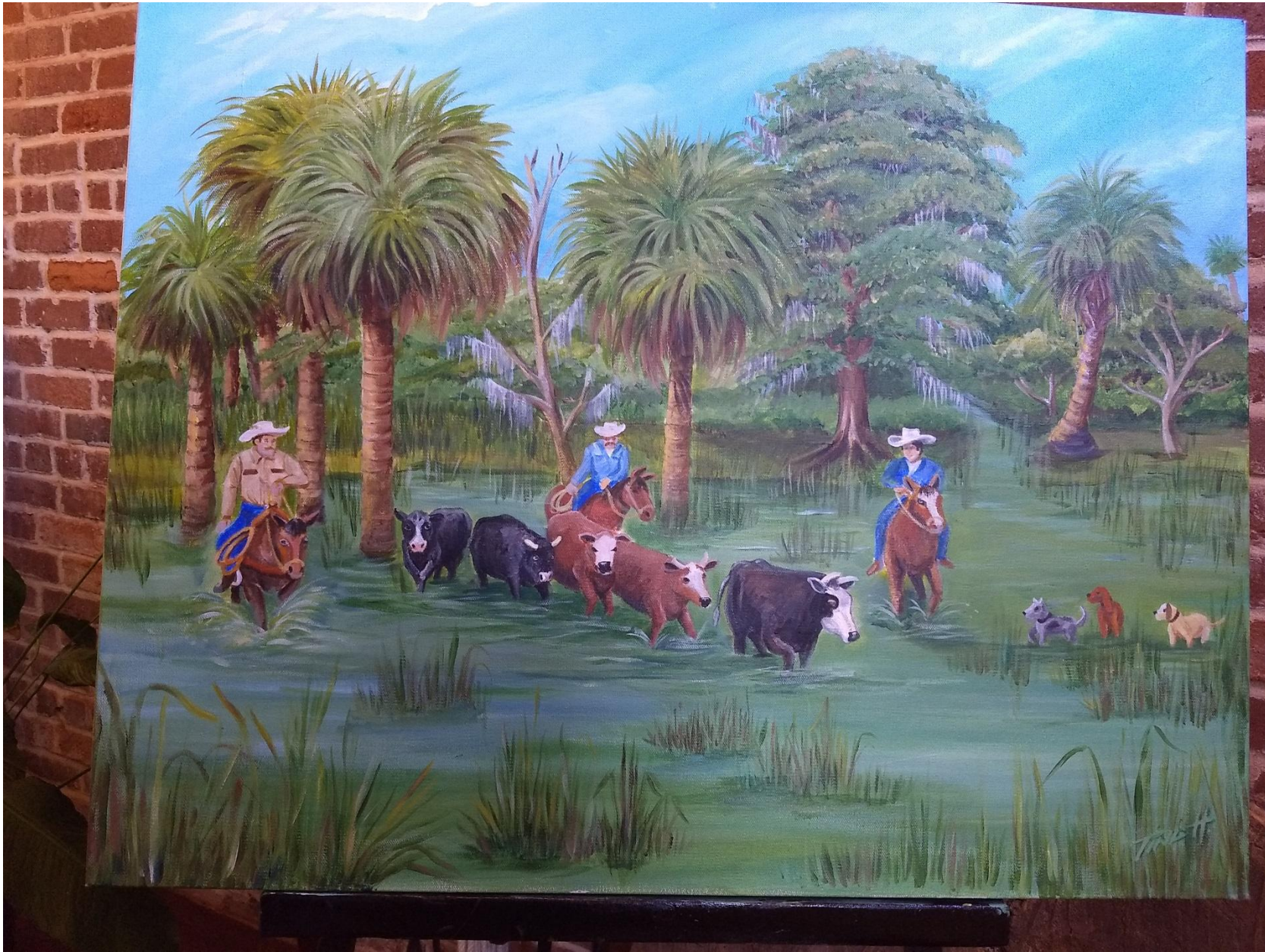
Artist's rendering of the proposed mural.