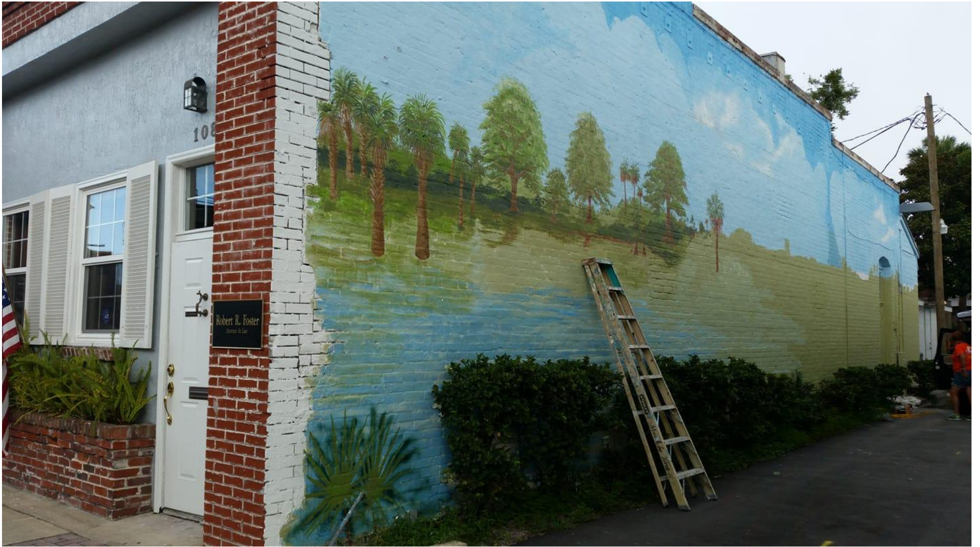
Now adding some water.