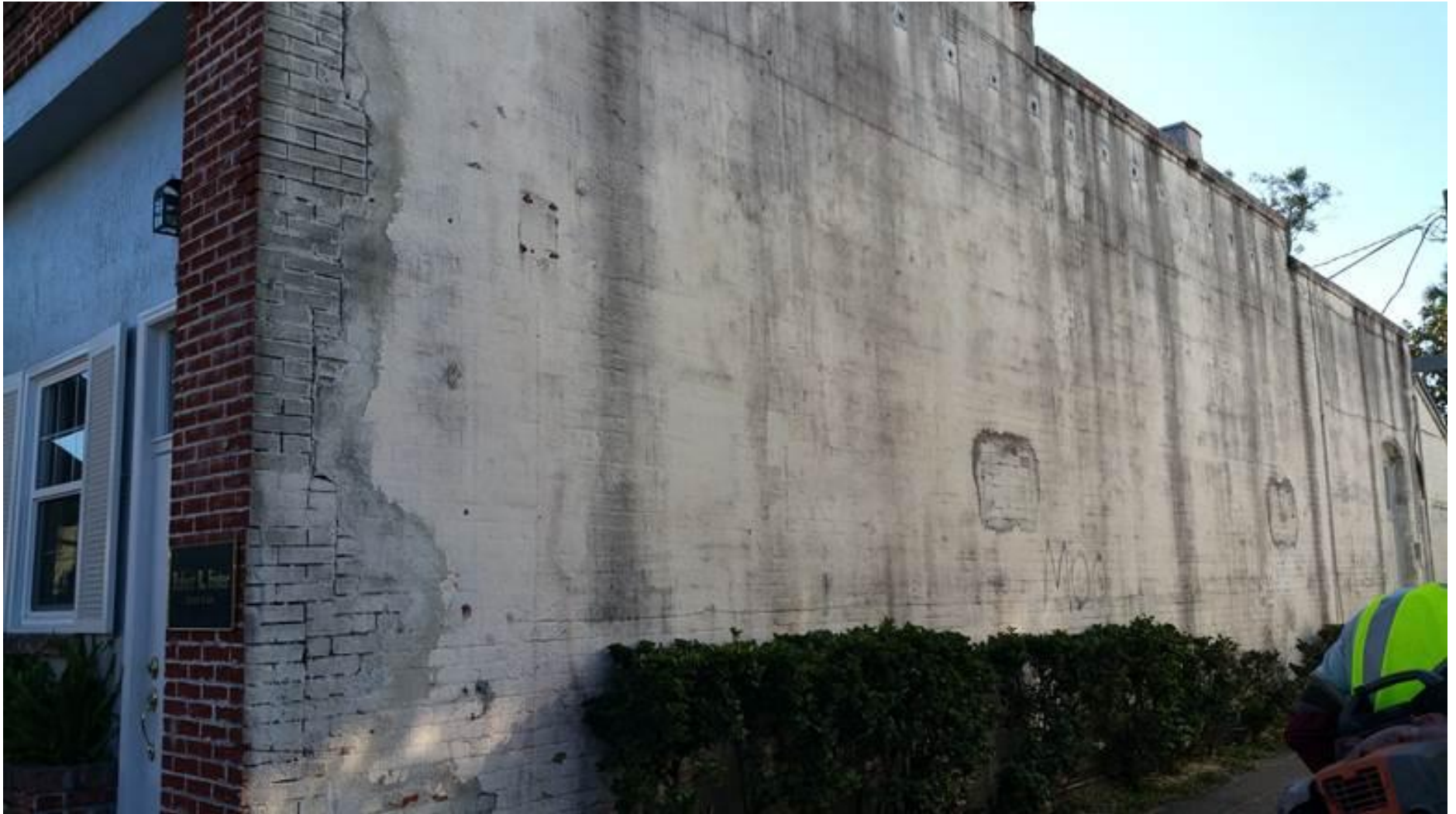
The wall before pressure washing. The eyesore of the alleyway!