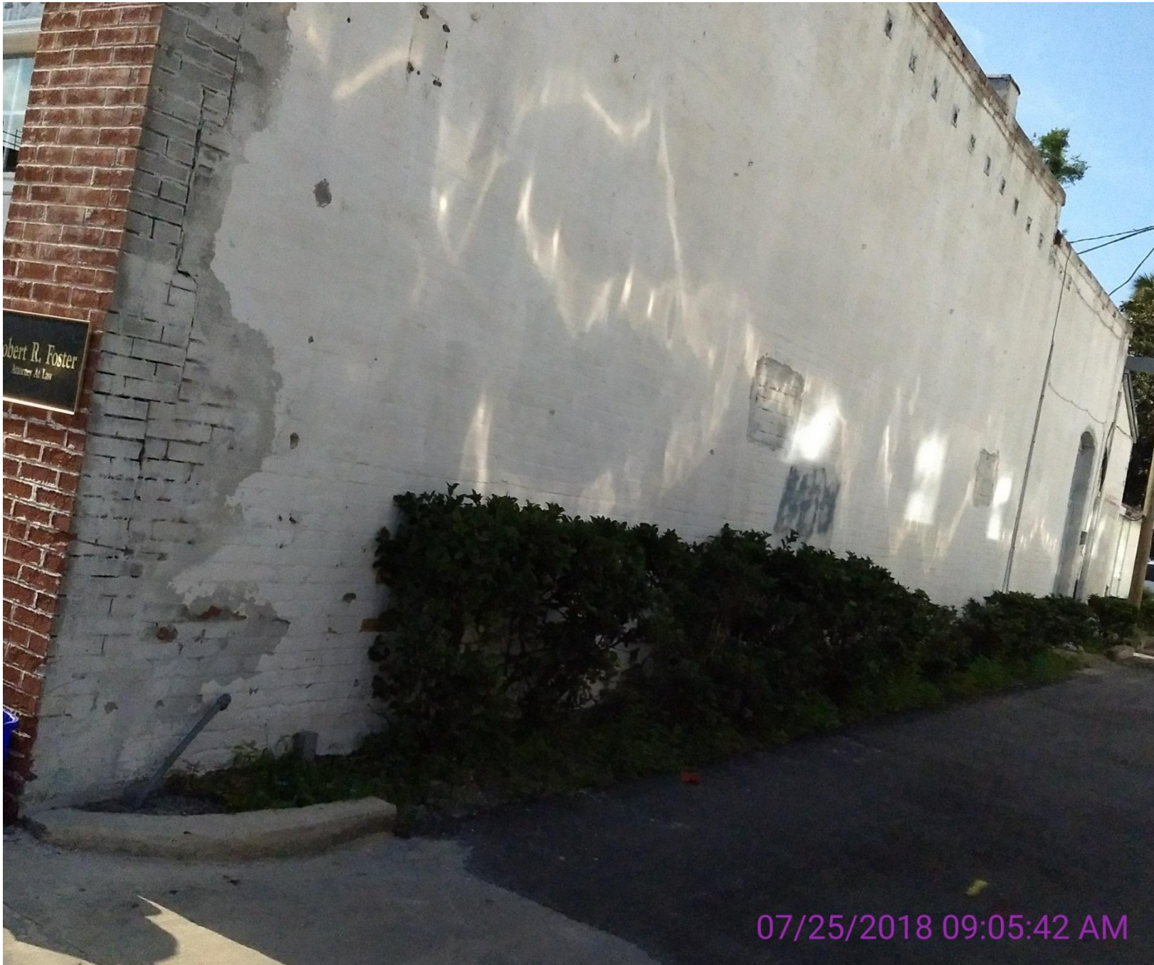
After Pressure Washing