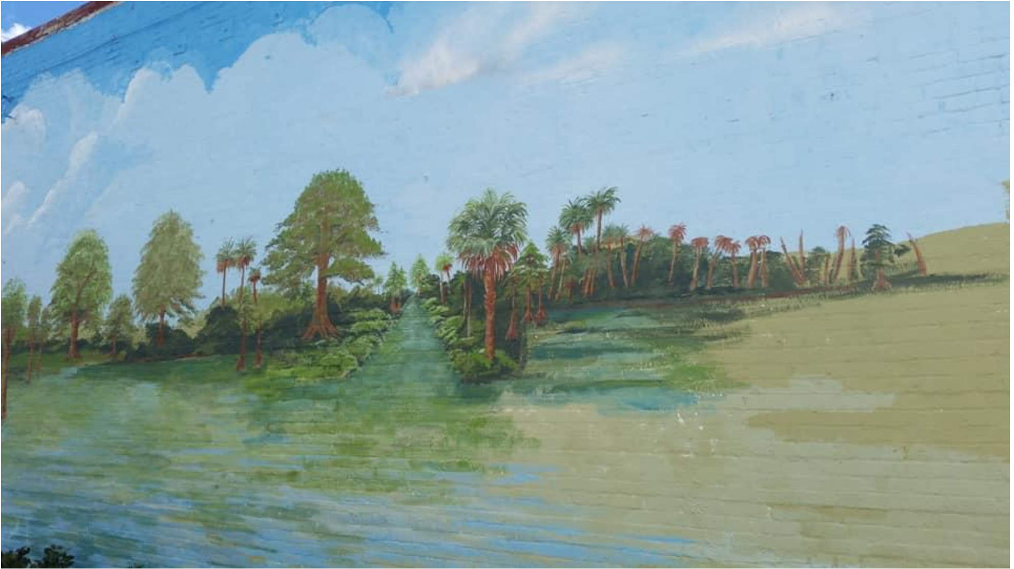
More Trees and water being added.