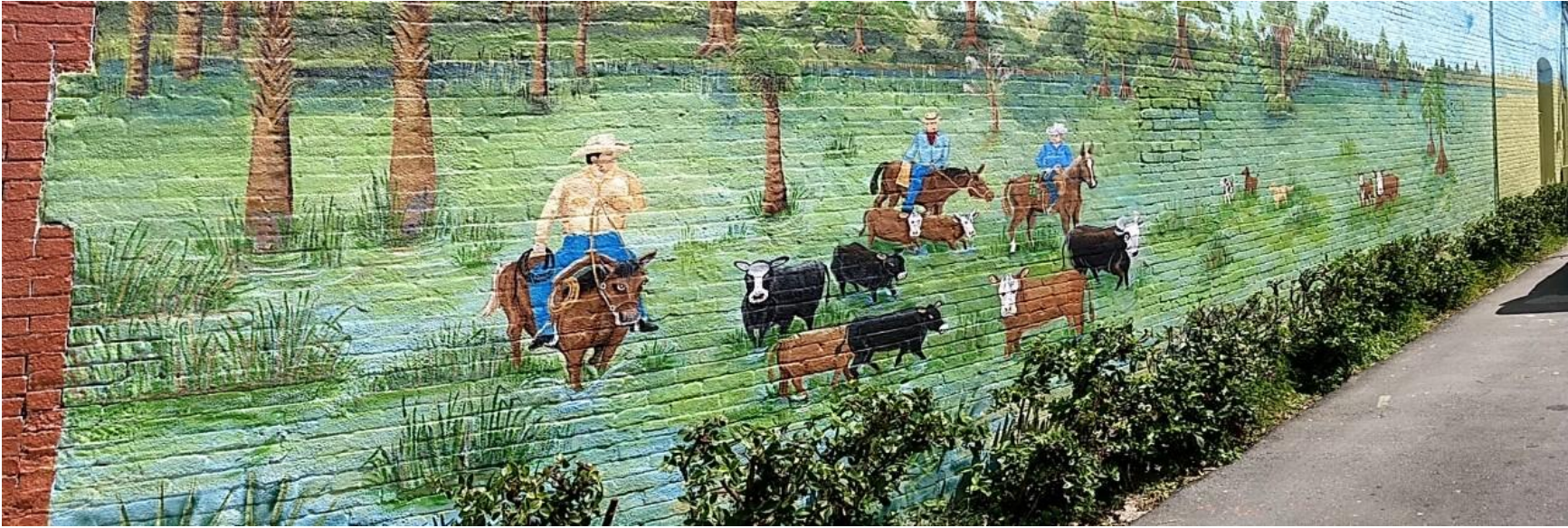
Fine tuning continues.