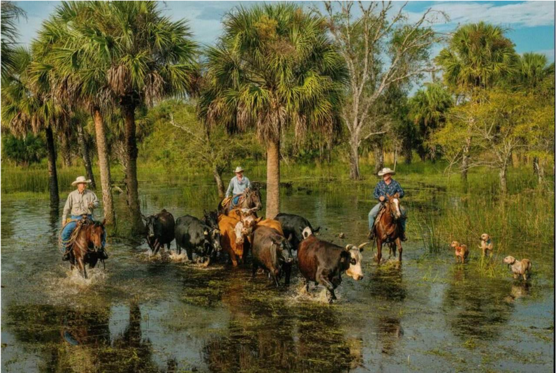
The proposed picture to use for the mural.