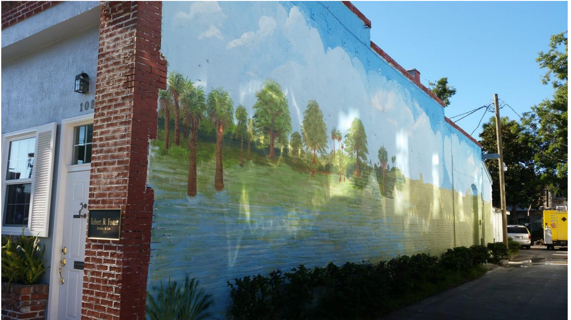
Not the trees are added.