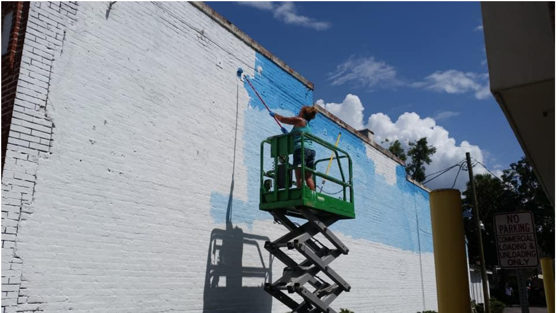
The Sky and Clouds being applied.