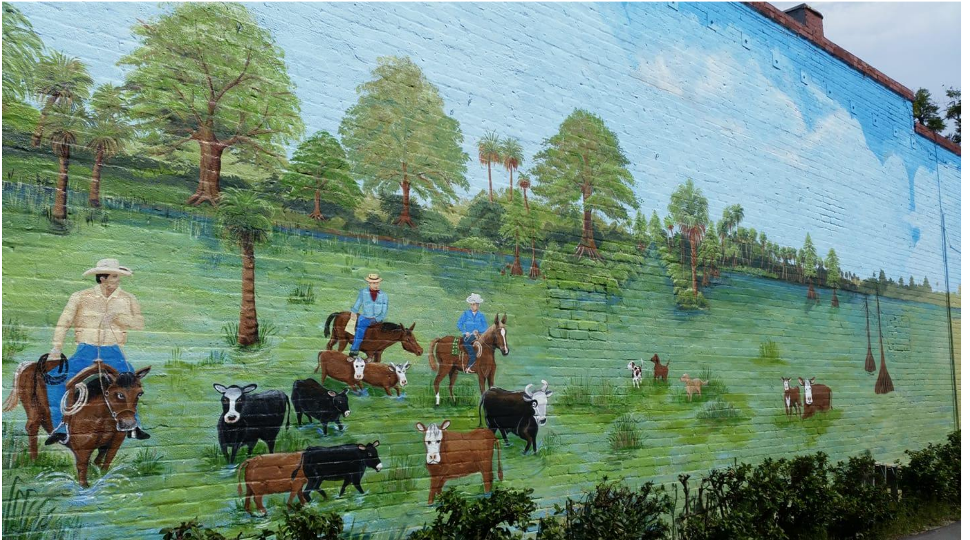
Now she is adding more detail of the people, horses and cows and a few dogs.