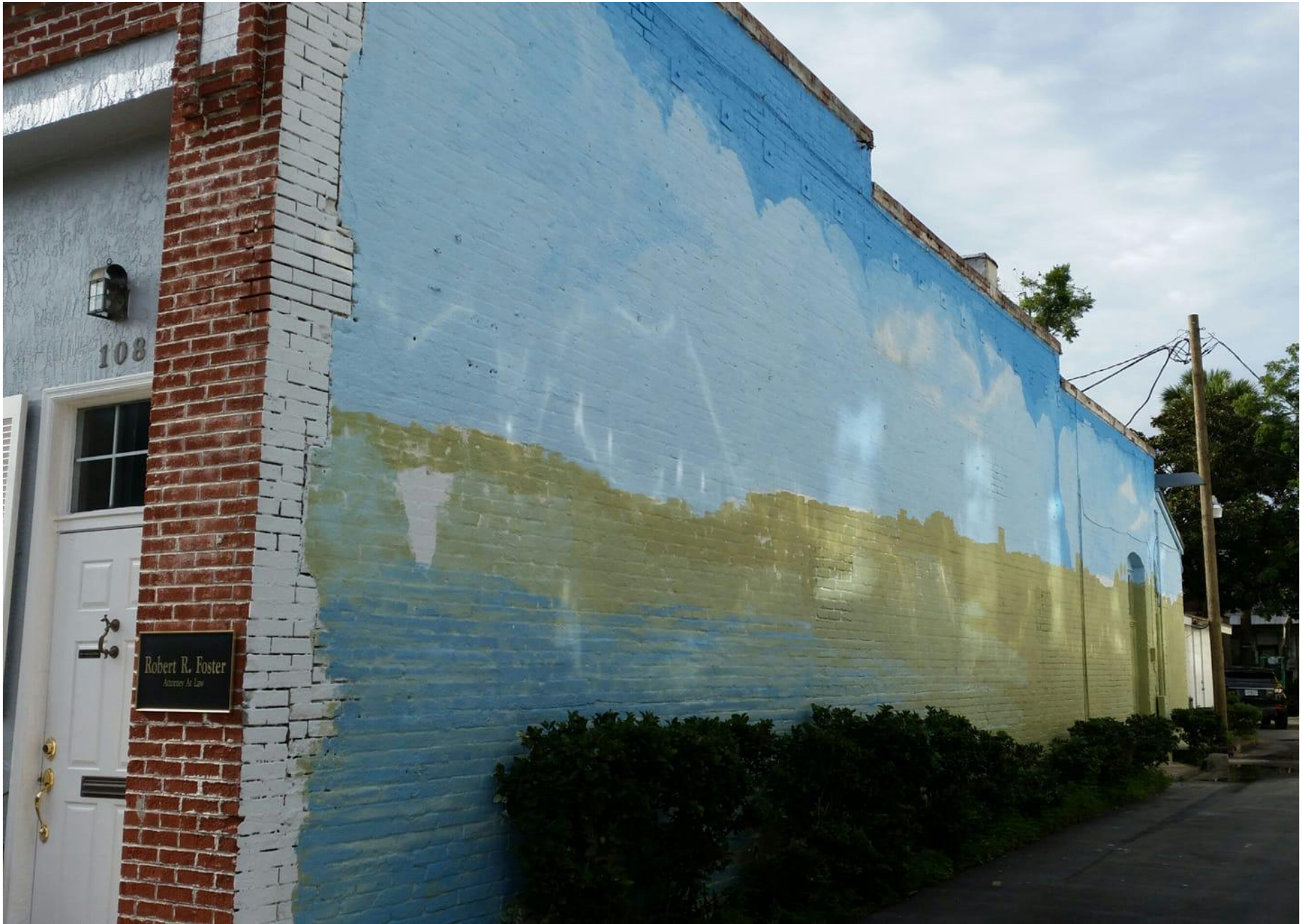
The landscaping begins.