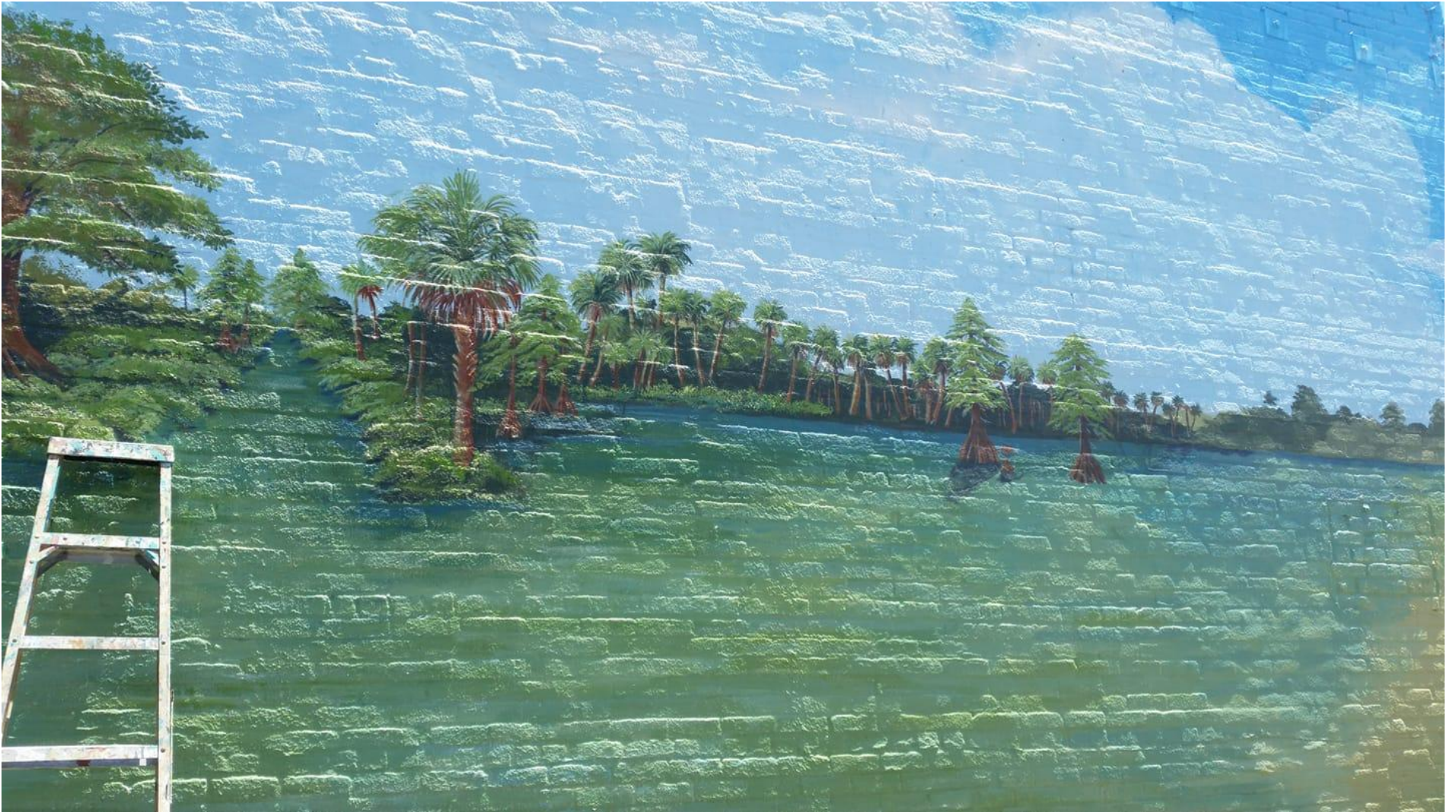
The landscape is taking shape.